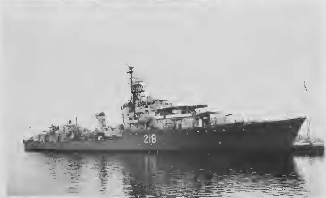
ONE OF Canada's "Tribal Class" destroyers is the H.M.C.S. Cayuga, pictured at Oranjestad.